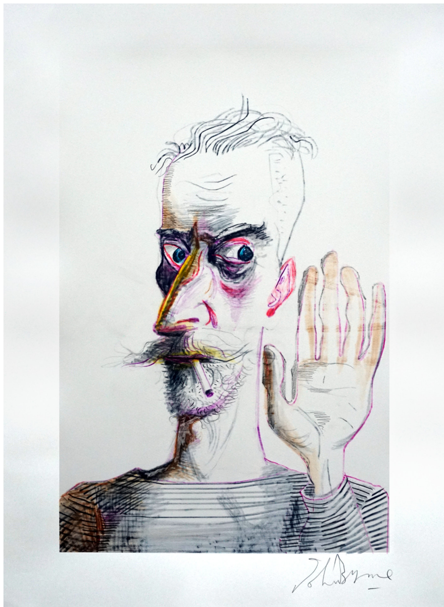
Untitled (Self-Portrait With Hand II)

Monotype with watercolour and drawing in ink and pencil, 56 x 76 cm.